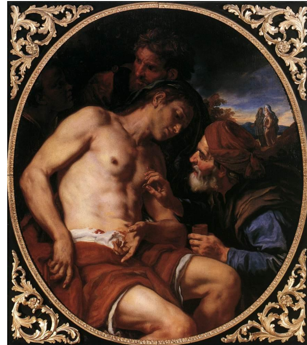
The Good Samaritan